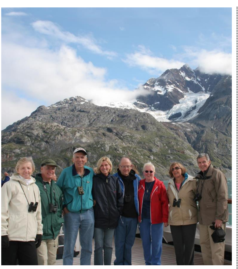
13 Days • 27 Meals: 12 Breakfasts, 7 Lunches, 8 Dinners

HIGHLIGHTS... Fairbanks, Sternwheeler Discovery, Music of Denali Dinner Theater, Denali National Park, Tundra Wilderness Tour, Luxury Domed Rail, Anchorage, Hubbard Glacier, Glacier Bay, Skagway, Juneau, Ketchikan, Inside Passage